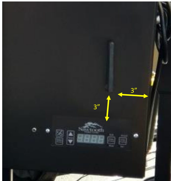
(Recommended mounting location)